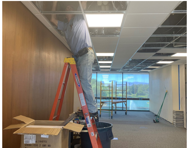
Keith Packer tackling electrical and communication upgrades associated with the City Hall 3rd floor remodel.