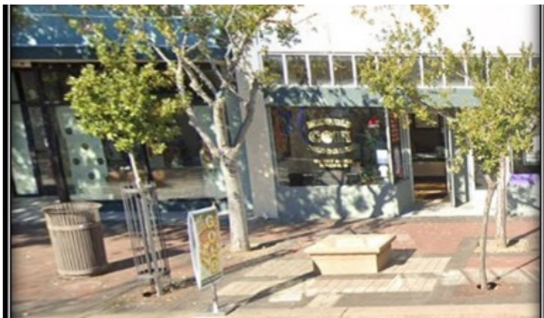
Typical street furniture to be removed.