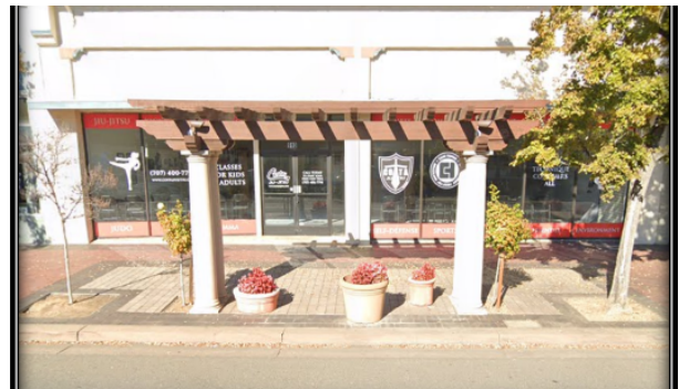
Typical Pergola to be removed.

On September 19, 2023, City Council authorized the city manager to execute a Professional Services Agreement with Gates + Associates to initiate the design of the Heart of Fairfield Downtown Streetscape Project. The project will remove street amenities previously installed in the 1990s along Texas Street between Pennsylvania Avenue and Jefferson Street to clear the palate and open the space. Existing trees, pergolas, and potted plants will be removed and replaced with new trees and art sculptures.